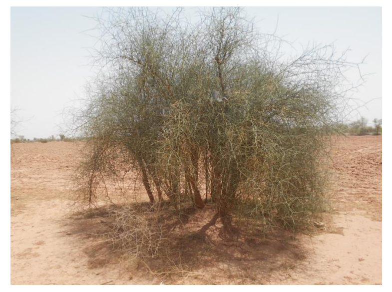
(a) Capparis decidua plant

Mediterranean Journal of Basic and Applied Sciences (MJBAS) Volume 8, Issue 1, Pages 114-129, January-March 2024