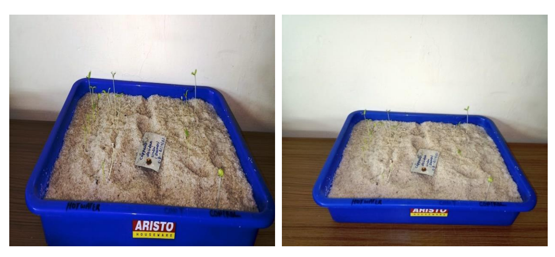
(d) Germination in Capparis decidua in Laboratory